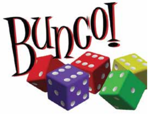
FRIDAY MARCH 27