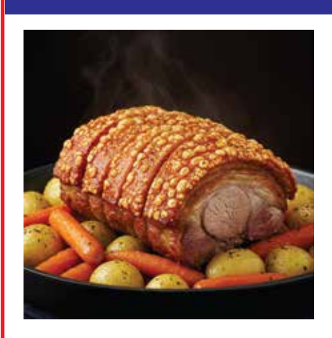
PORK ROAST with Potatoes & Carrots $15 a plate Serving 6 to 7:30pm