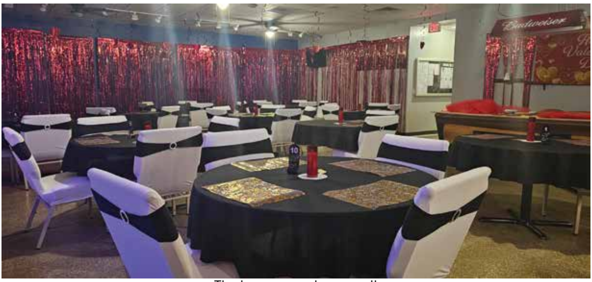
The lounge scrubs up well